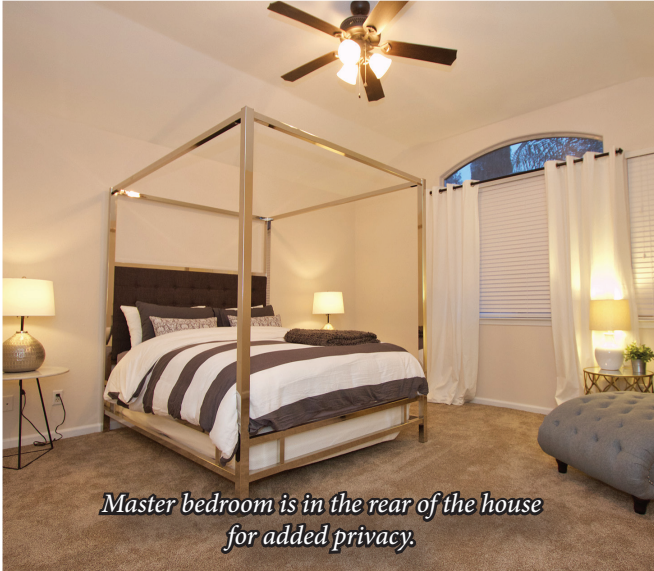
Master bedroom is in the rear of the house for added privacy.

With close proximity to great shopping, the San Joaquin River, the downtown area, restaurants, and easy freeway access, everything your family wants or needs is nearby.