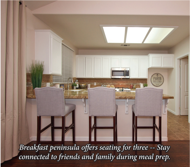
Breakfast peninsula offers seating for three -- Stay connected to friends and family during meal prep.