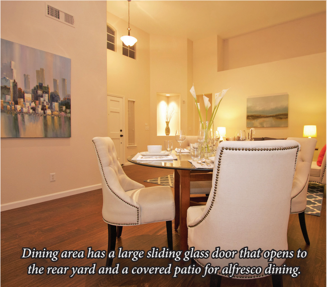
Dining area has a large sliding glass door that opens to the rear yard and a covered patio for alfresco dining.