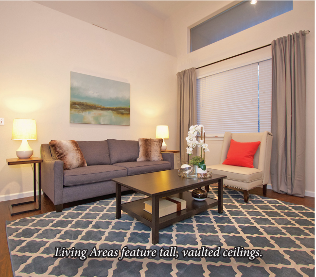
Living Areas feature tall, vaulted ceilings.