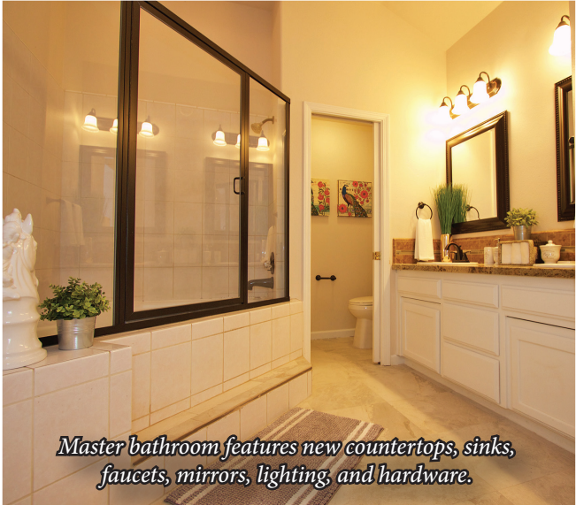
Master bathroom features new countertops, sinks, faucets, mirrors, lighting, and hardware.