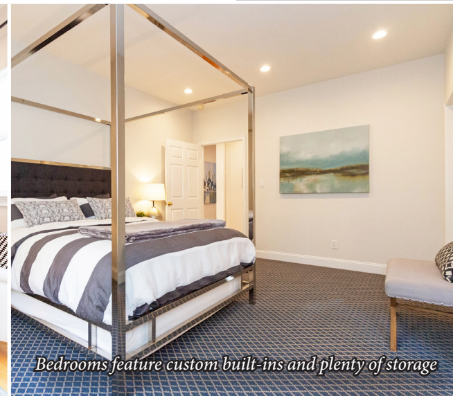
Bedrooms feature custom built-ins and plenty of storage