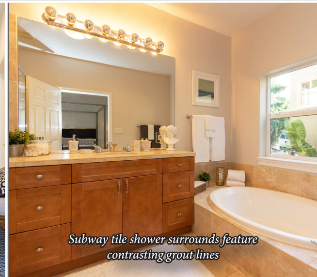
Subway tile shower surrounds feature contrasting grout lines