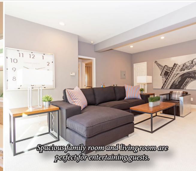
Spacious family room and living room are perfect for entertaining guests.