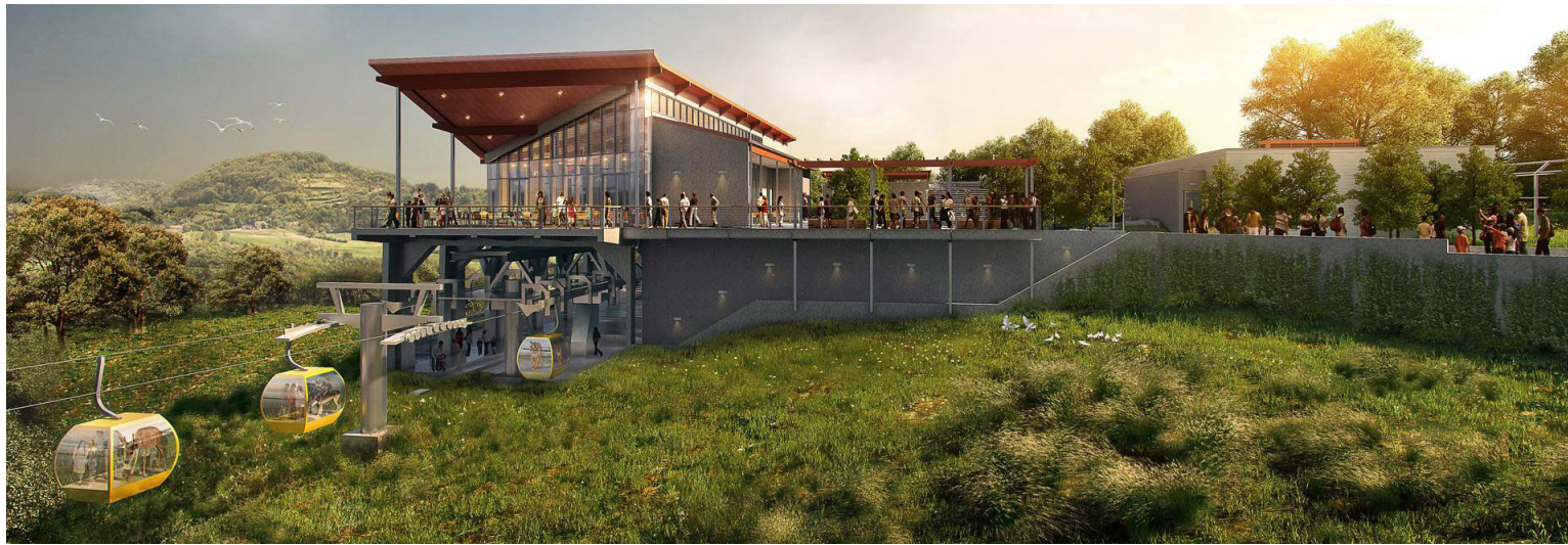
In the area are the Oakland Zoo, Joseph Knowland State Arboretum and Park, Sequoyah Country Club, and Lake Chabot Golf Course.