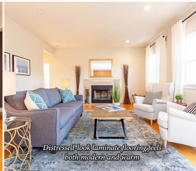
Distressed-look laminate flooring feels both modern and warm