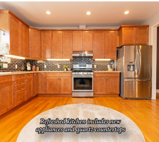
Refreshed kitchen includes new appliances and quartz countertops