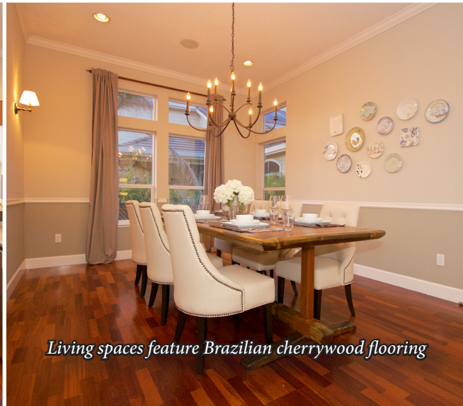
Living spaces feature Brazilian cherrywood flooring