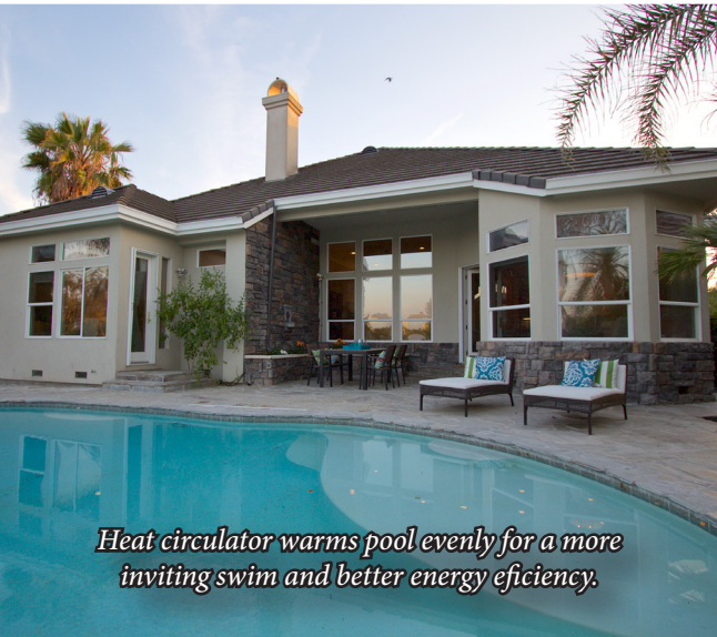
Heat circulator warms pool evenly for a more inviting swim and better energy efficiency.