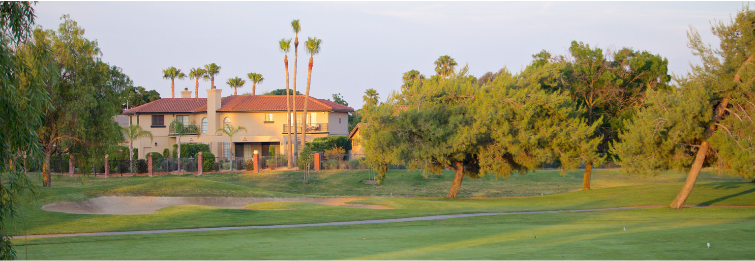
1011 Saint Andrews Drive sits right off the 10th hole of Discovery Bay Country Club's private 18-hole championship golf course — situated on 225 acres of meticulously maintained fairways, greens and clubhouse grounds.