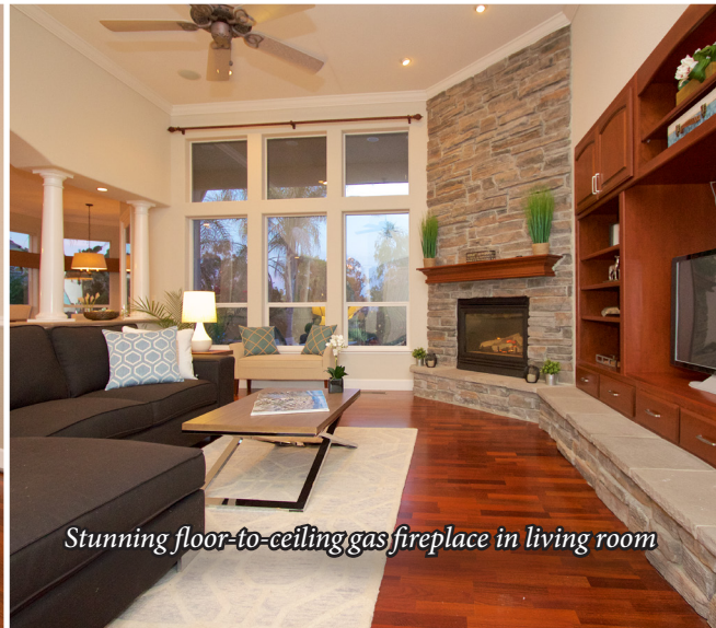
Stunning floor-to-ceiling gas fireplace in living room