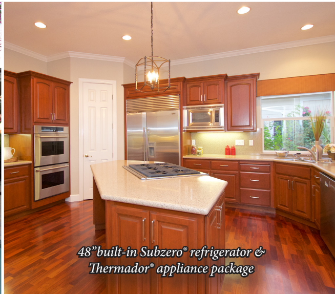
48" built-in Subzero® refrigerator & Thermador® appliance package