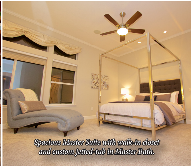
Spacious Master Suite with walk-in closet and custom jetted-tub in Master Bath.