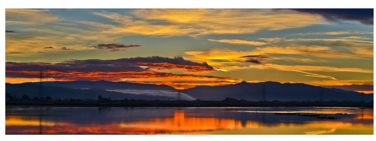
864 St. Bede Lane is within walking distance to the San Mateo-Hayward Bridge and the San Francisco Bay waterfront, home to some of the most breathtaking views found in the Bay Area.