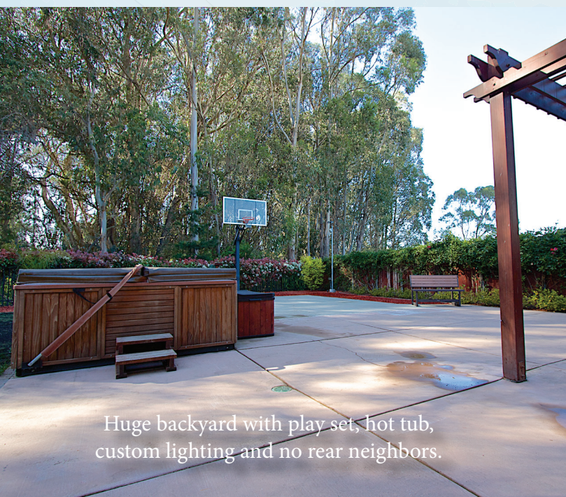
Huge backyard with play set, hot tub, custom lighting and no rear neighbors.

Enter 853 Meadow View Drive through the double entry doors and be drawn into an incredible, two-story formal area with filtered sunlight streaming from floor-to ceiling windows. From here, a sweeping, spiral staircase visually connects the second level, wrap-around bannister and loft-office area. A "Juliet" balcony feature gives this space a dramatic, architectural counter-point.