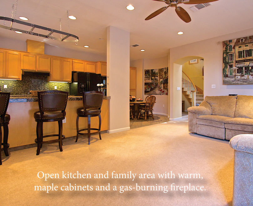
Open kitchen and family area with warm, maple cabinets and a gas-burning fireplace.