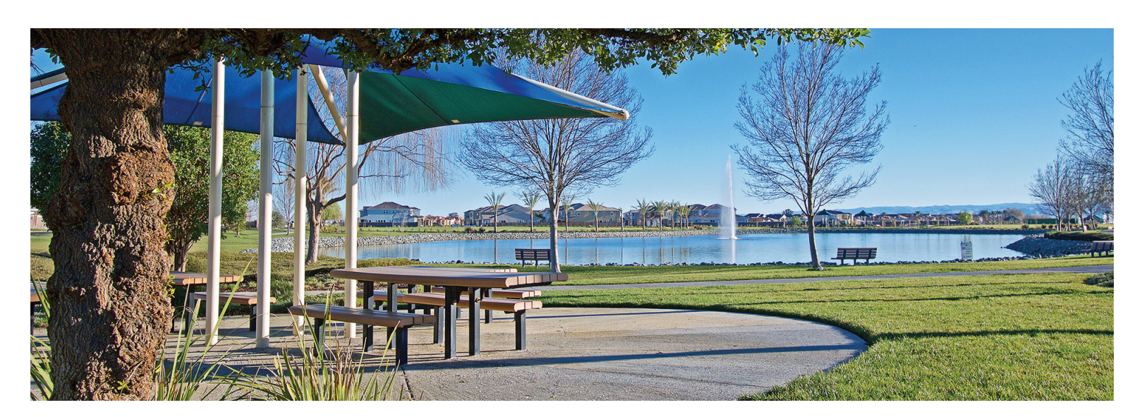
Discovery Bay enjoys a wonderful spectrum of seasonal climates including everything from warm summers to temperate winters.