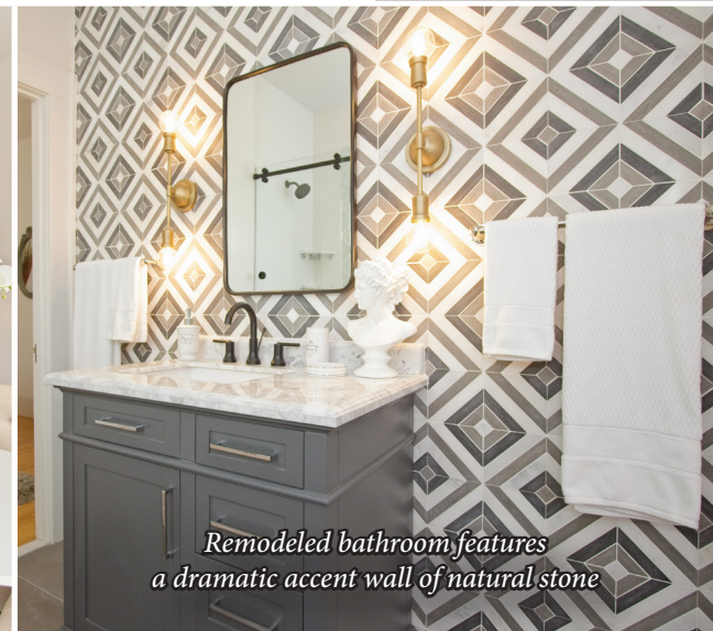
Remodeled bathroom features a dramatic accent wall of natural stone