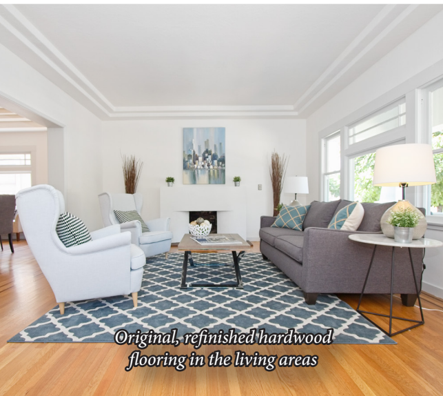
Original, refinished hardwood flooring in the living areas