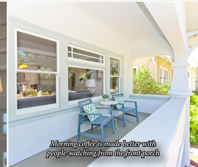
Morning coffee is made better with people-watching from the front porch