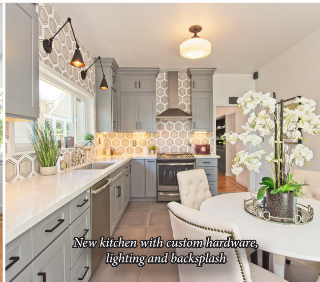
New kitchen with custom hardware, lighting and backsplash