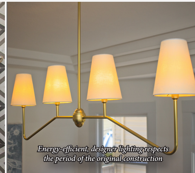
Energy-efficient, designer lighting respects the period of the original construction