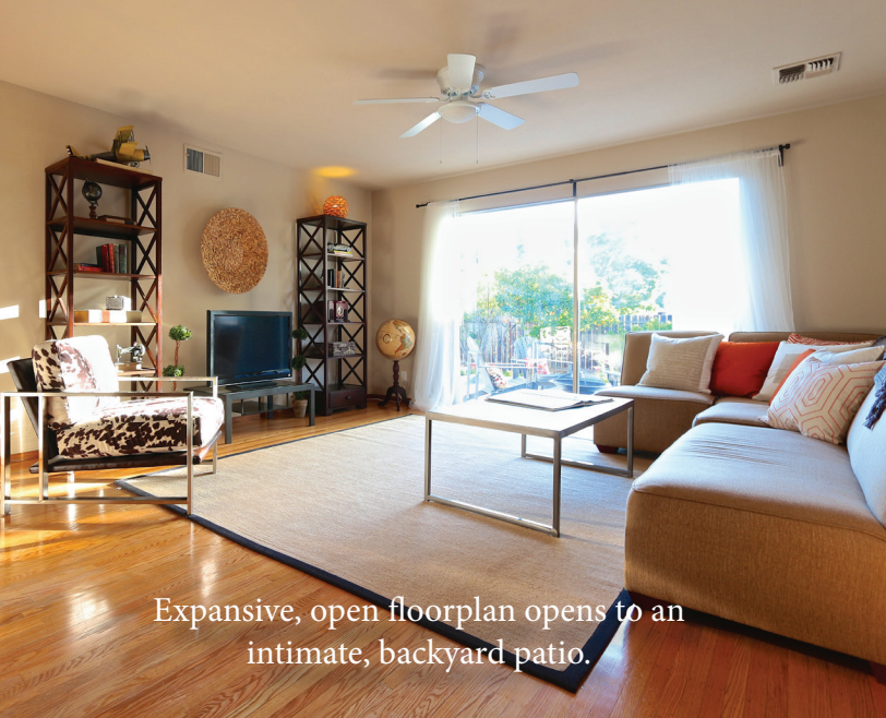
Expansive, open floorplan opens to an intimate, backyard patio.