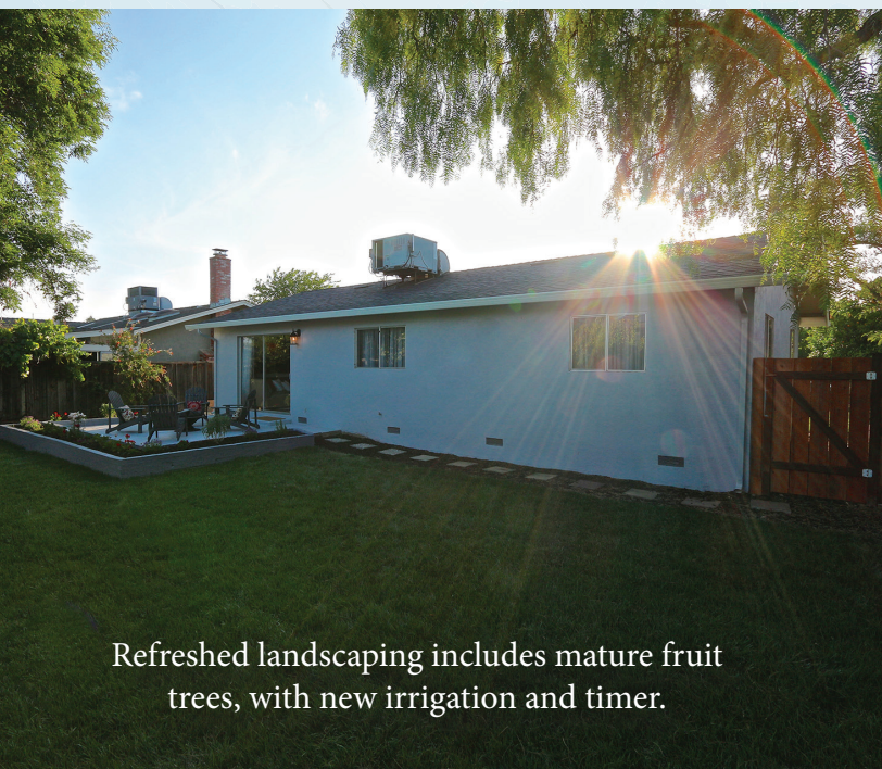
Refreshed landscaping includes mature fruit trees, with new irrigation and timer.

440 Meadowlark is a newly-revived home whose restoration was managed by the design team, and property marketing experts, at Lifestyle Real Estate Services. Our design team was inspired to rehabilitate the home into something fantastic – a space that speaks to our unique perspective. The renewed aesthetic is clean, modern, and fresh with an unexpected attention to detail.