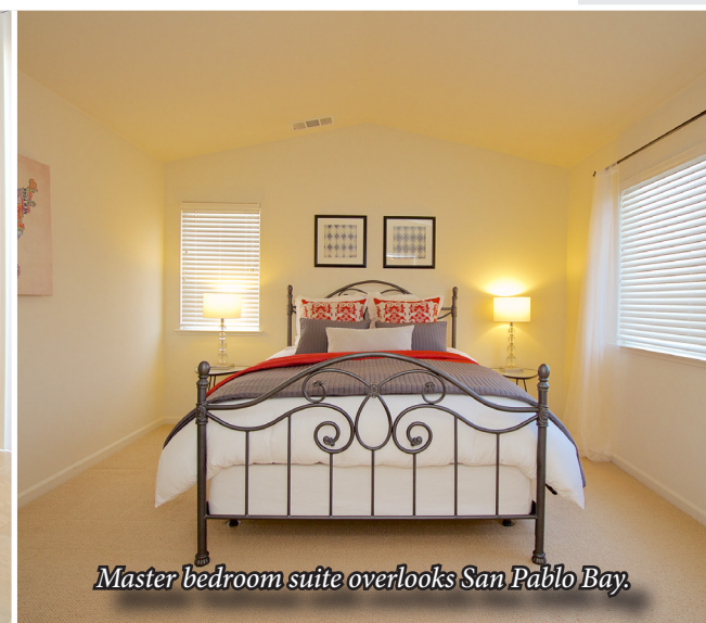
Master bedroom suite overlooks San Pablo Bay.