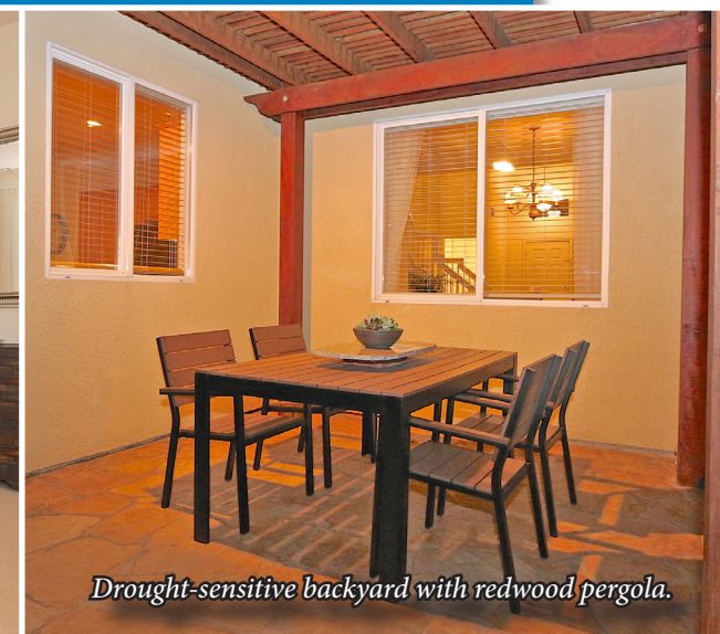
Drought-sensitive backyard with redwood pergola.