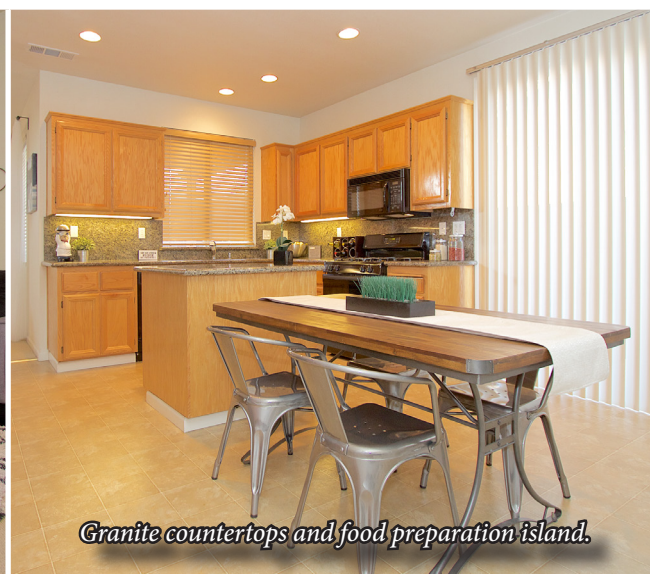
Granite countertops and food preparation island.