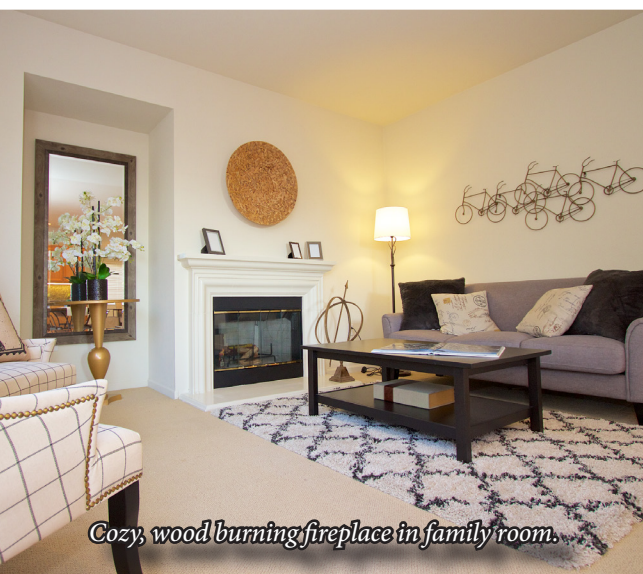
Cozy, wood burning fireplace in family room.

Once you're on the site, click the link at the top to see our Blog. Every day the real estate market changes, and we help buyers and sellers just like you avoid market pitfalls and gain the upper hand. Not just ordinary real estate sales people, we're experts at real estate marketing. Our blog is our chance to share our experiences with you.