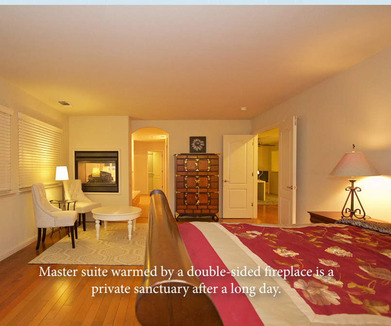
Master suite warmed by a double-sided fireplace is a private sanctuary after a long day.