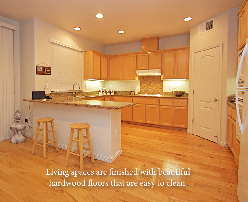
Living spaces are finished with beautiful hardwood floors that are easy to clean.