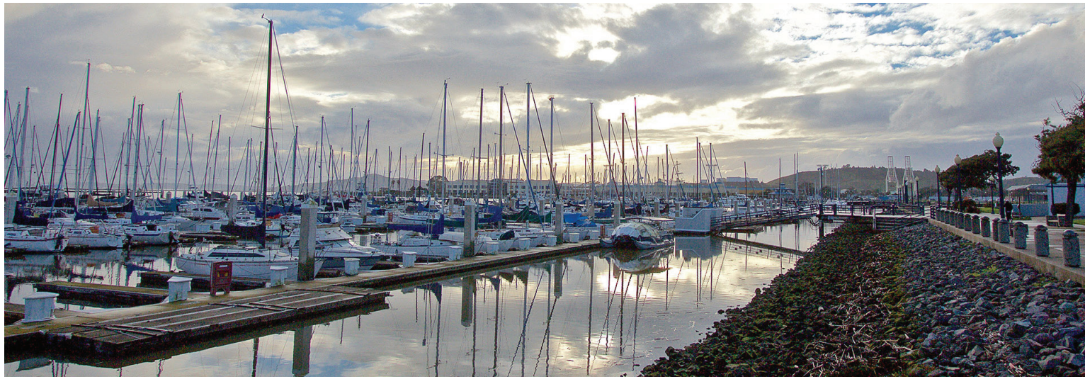
Marina Bay, located on Richmond's Inner Harbor, was redeveloped in the 1980s to provide waterfront living, and is also home to retail and light-industry businesses. Marina Bay also includes the Marina Bay Harbor, the San Francisco Bay Trail, parks (including a national historic park) and the Rosie the Riveter Memorial.