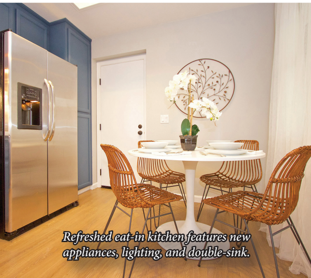
Refreshed eat-in kitchen features new appliances, lighting, and double-sink.