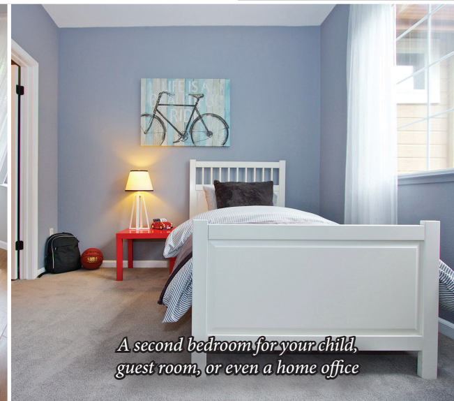
A second bedroom for your child, guest room, or even a home office