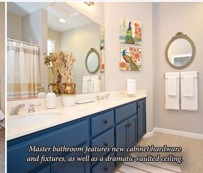
Master bathroom features new cabinet hardware and fixtures, as well as a dramatic vaulted ceiling.