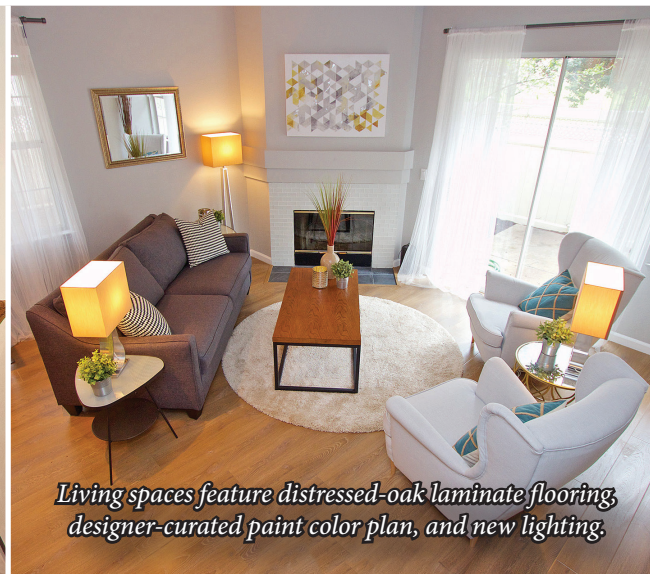
Living spaces feature distressed-oak laminate flooring, designer-curated paint color plan, and new lighting.