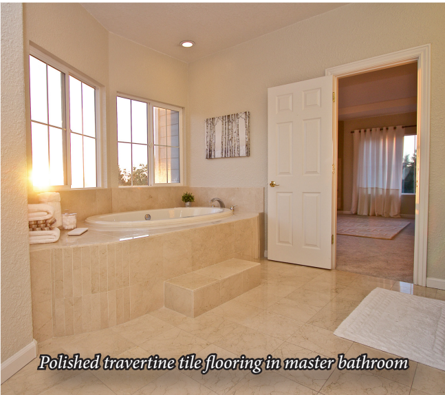
Polished travertine tile flooring in master bathroom