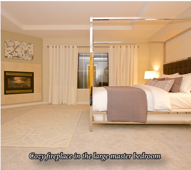
Cozy fireplace in the large master bedroom