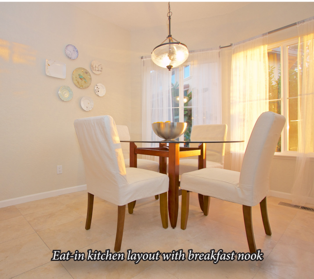
Eat-in kitchen layout with breakfast nook