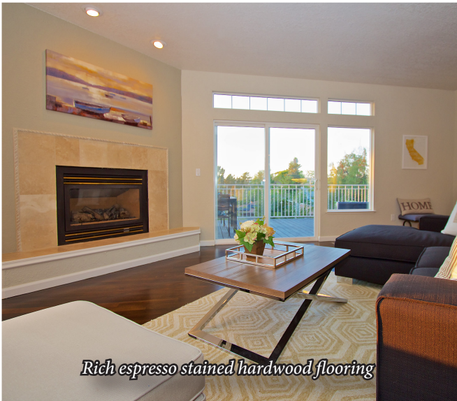
Rich espresso stained hardwood flooring

Tucked away on a hill at the end of Arenal Court, this home enjoys trouble-free access to freeways, downtown shopping, and schools — but without the traffic or noise that can accompany those amenities elsewhere.