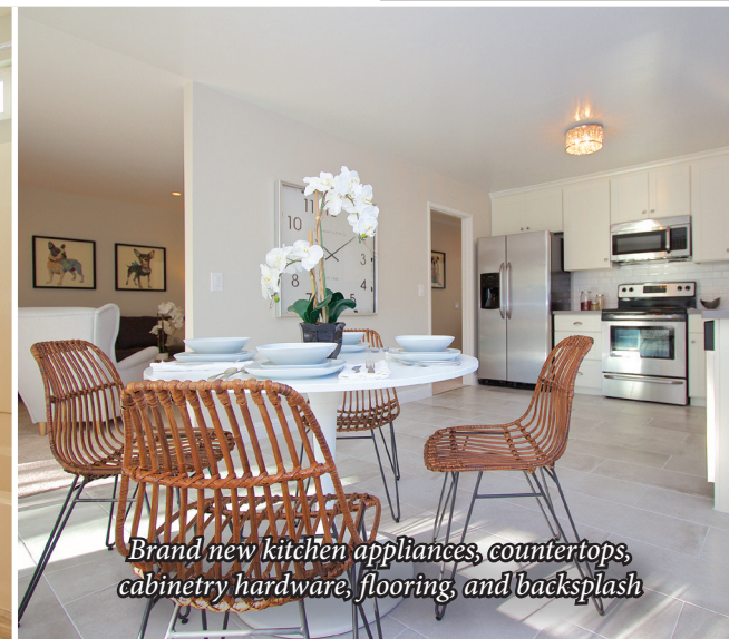
Brand new kitchen appliances, countertops, cabinetry hardware, flooring, and backsplash