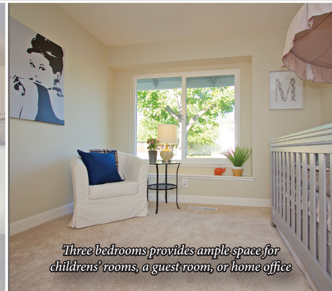
Three bedrooms provides ample space for children's rooms, a guest room, or home office