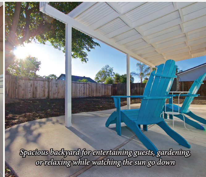
Spacious backyard for entertaining guests, gardening, or relaxing while watching the sun go down