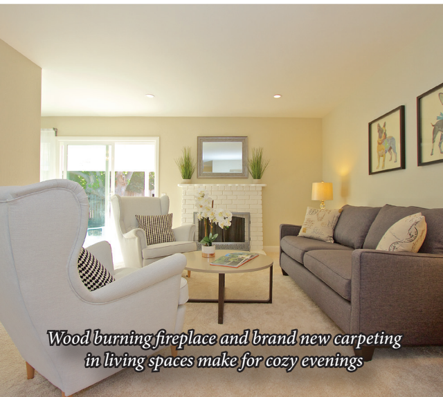
Wood burning fireplace and brand new carpeting in living spaces make for cozy evenings