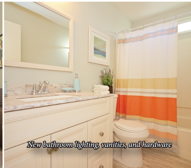
New bathroom lighting, vanities, and hardware