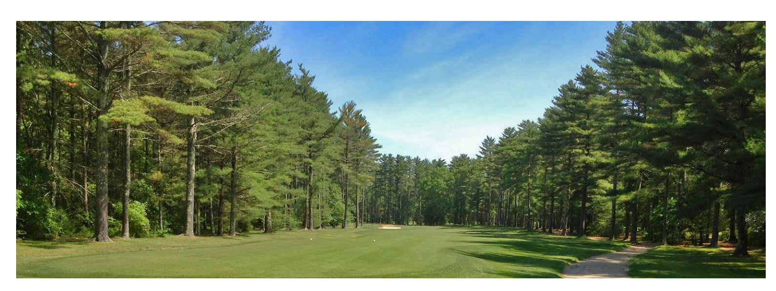
Richmond Country Club is situated in a gated enclave overlooking San Pablo Bay. The club offers Bay Area golfers a historic course with fantastic practice facilities.